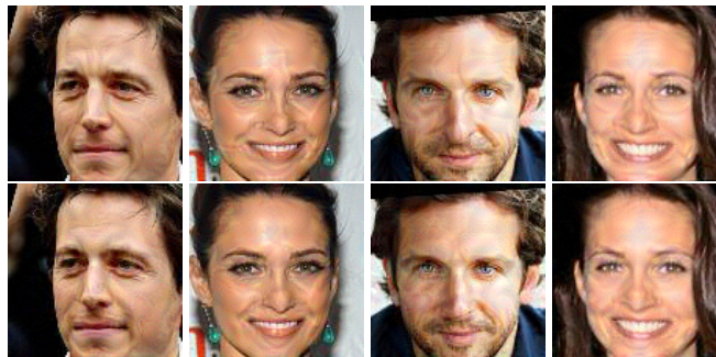
Figure 3: LowKey attacked images computed without (above) and with (below) Gaussian smoothing.

We additionally produce images both with and without smoothing in the attack pipeline. Before feeding them into facial recognition systems, we defend the system against our attacks by applying a Gaussian smoothing pre-processing step just before inference. We find that facial recognition systems which use this pre-processing step perform equally well on rank-50 (but not rank-1) accuracy compared to performance without smoothing, and they are also able to defeat attacks which are not computed with Gaussian smoothing. On the other hand, attacks computed using Gaussian smoothing are able to counteract this defense and fool the facial recognition system (see Table 9). This suggests that attacks that use Gaussian smoothing in their pipeline are more robust and harder to defend against. See Appendix A.6 for details regarding Gaussian smoothing hyperparameters.