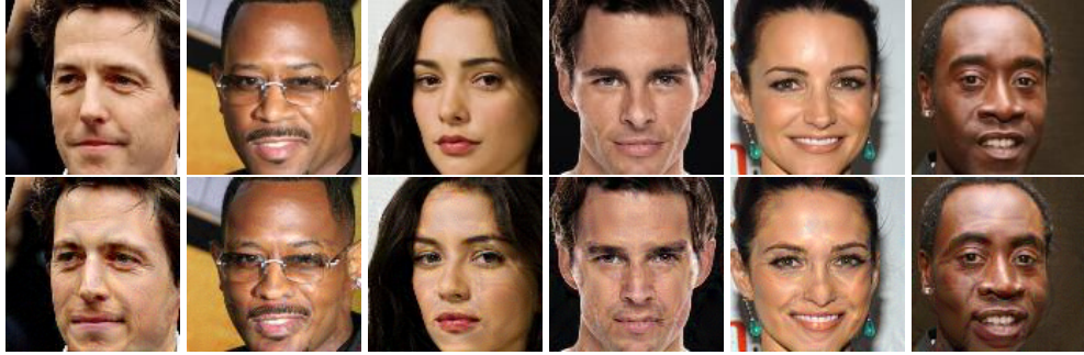
Figure 1: Top: original images, Bottom: protected by LowKey.

tool, LowKey, for protecting users from unauthorized surveillance by leveraging adversarial attack methods and make it publicly available as a webtool. LowKey is the first such evasion tool that is effective against commercial facial recognition APIs. Our system pre-processes user images before they are made publicly available on social media outlets so they cannot be used by a third party for facial recognition purposes. We establish the effectiveness of LowKey throughout this work.